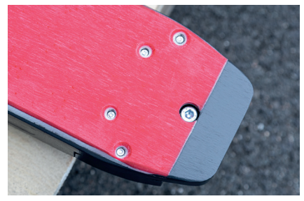
AGV sensor fork with anti-slip coating